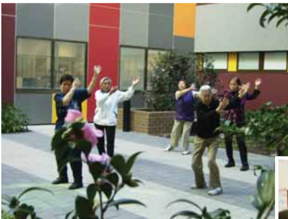
Tai Chi demonstration in Auburn Hospital courtyard