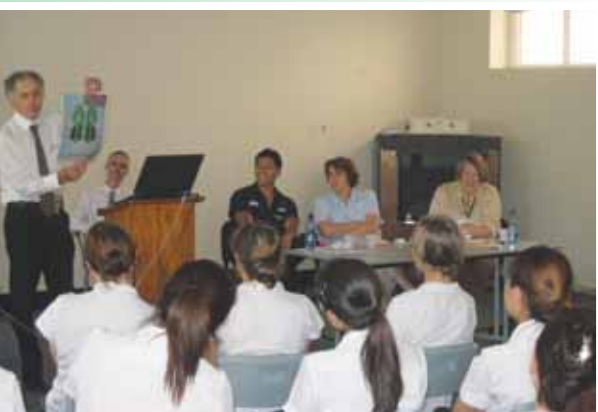
Balmian Hospital Falls Debate