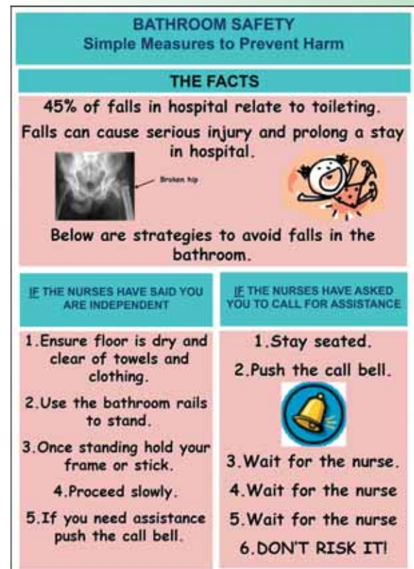
Winning poster at Prince of Wales Hospital

SESIAHS snapshot from an extract from C E newsletter communications, reprinted with permission