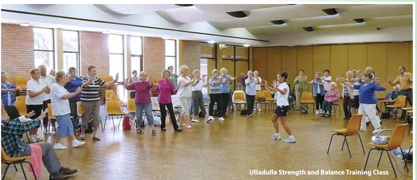
Ulladulla Strength and Balance Training Class