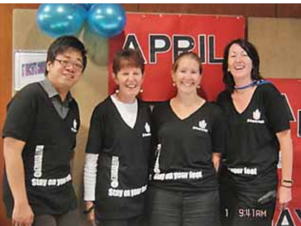
St Vincent Community Health Staff