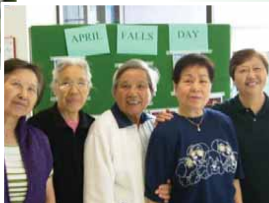
Members of the local Chinese Tai Chi group