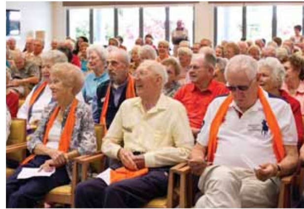
Guests at Woollooware Shores April Falls Month Presentation

As an organisation ARV is committed to the Better Balance Program to prevent falls of not only our residents but those older people living in the community.