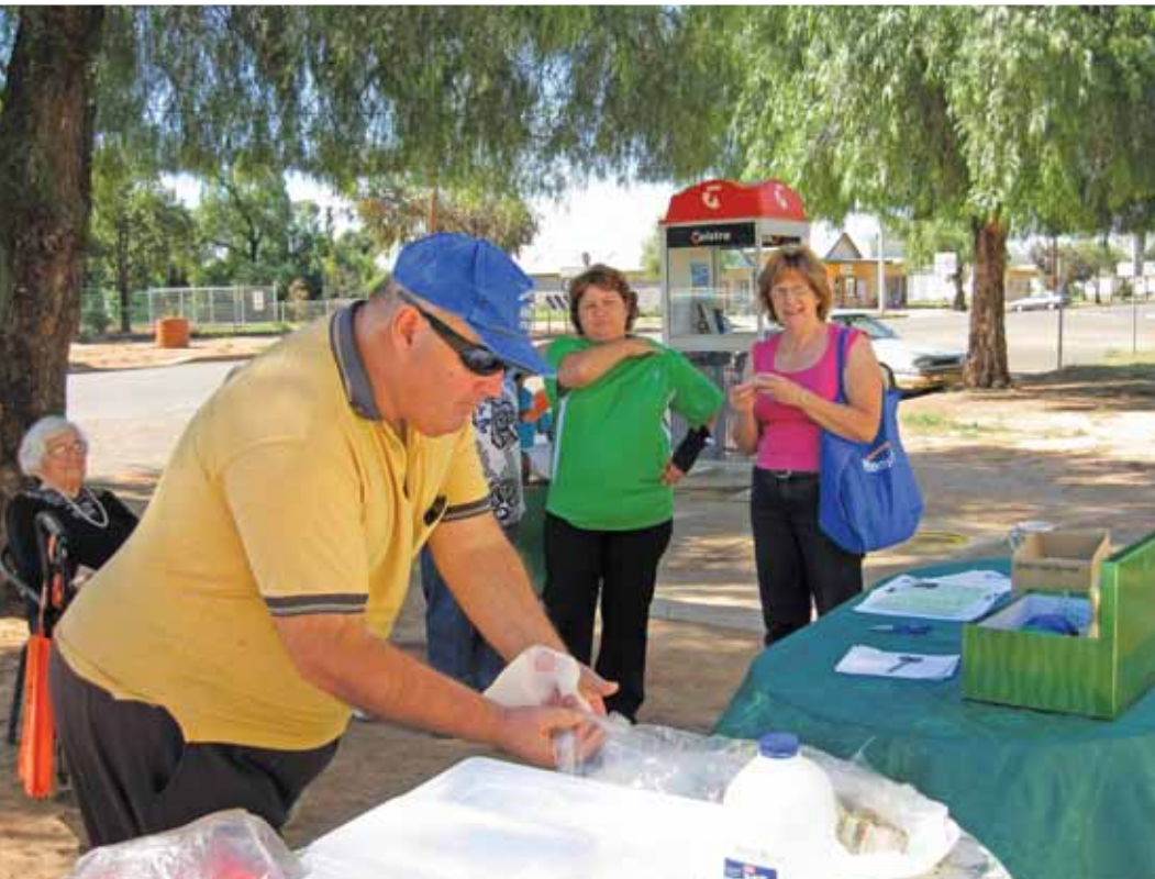
Ivanhoe's tree of knowledge

April Falls Day will be showcased in the winter edition of the Health Promotion newsletter.