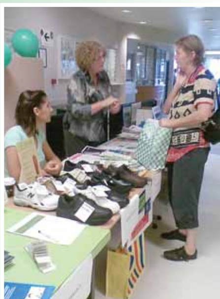
TACT Safe Footwear Display