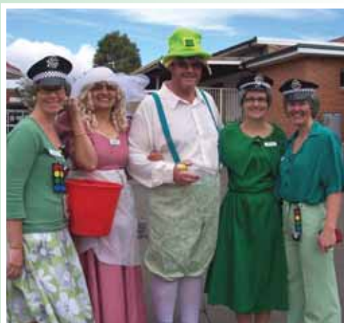
Bulli Hospital Staff dressed in Jack and Jill theme for Falls Prevention

Certificates of Appreciation were given to Hospitals and Community Health Services that participated in April Falls Day 2010.