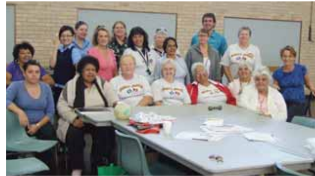
Aunty Jeans program