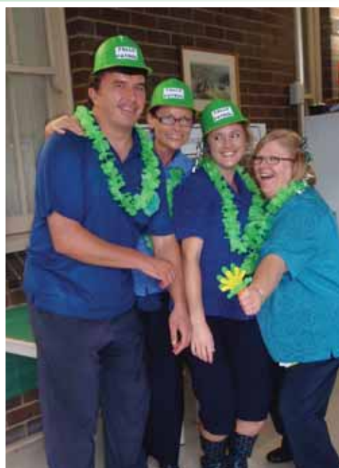
Kiama Hospital Staff Falls Patrol