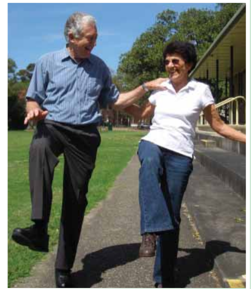
Exercise that challenges balance is the single most effective intervention to prevent falls in older people