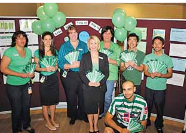
Fairfield Hospital Staff