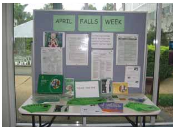
Display of materials on Falls Prevention in Hospital foyer at Port Macquarie Base Hospital.