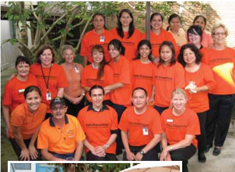
Gowrie Village Staff