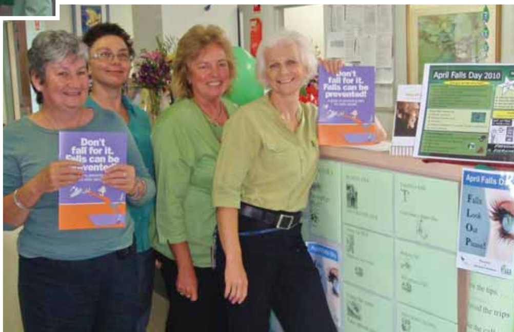
David Berry Hospital Palliative Care staff at their falls prevention ward display