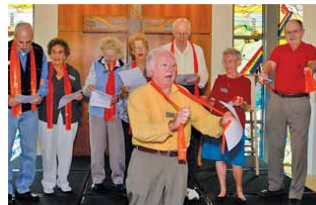
Woollooware Shores April Falls Month