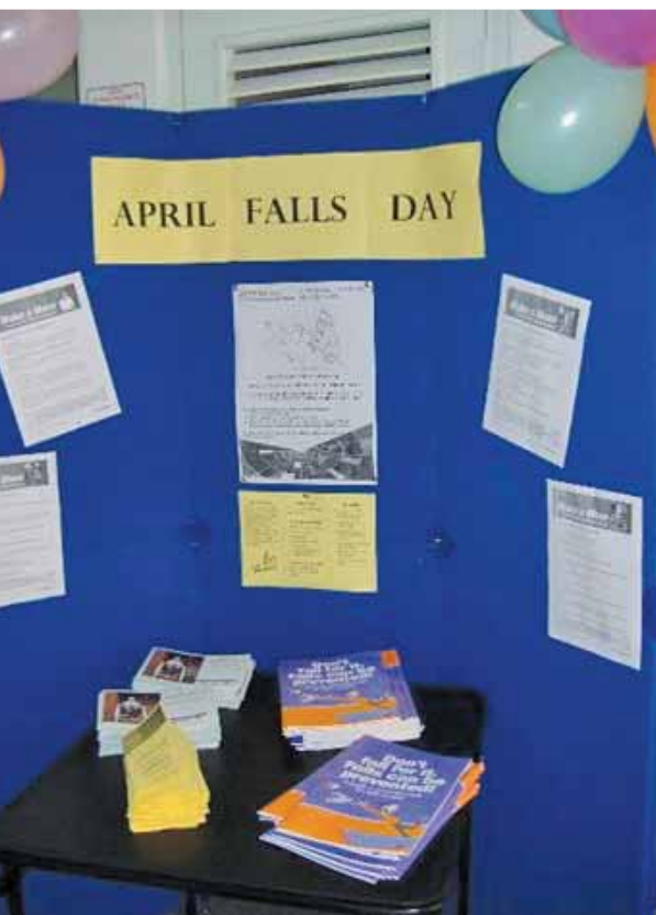
Narabri community health display

The program is being run weekly at Narrabri Community Health.